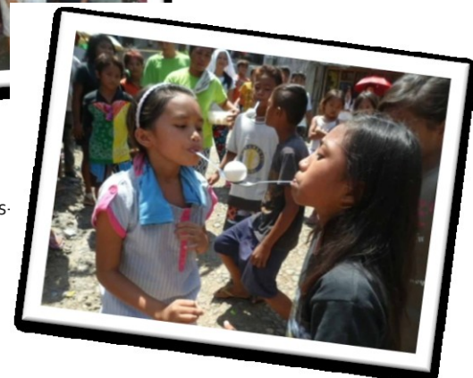
Children play the "pass-the-egg game."