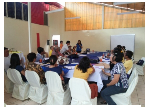
Courtesy call in DAR Bukidnon Province

At present, an Inception Report is being written which will be the basis of the BDS activities to be conducted.