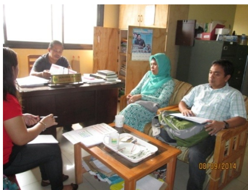
Courtesy Call with PARO II, MARO and DAR ARMM ARCESS Point Person in Poona Bayabao

Room 401 Jubilee Bldg., Jacinto St., Davao City Email Address: isedi@addu.edu.ph Website Address: http://isedi.addu.edu.ph