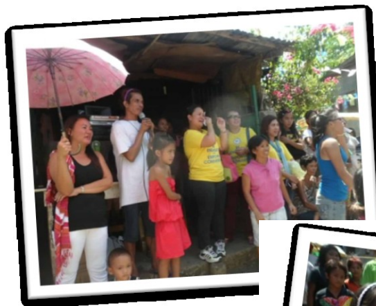
ISEDI team witnessed the activity.

The favorable outcomes and positive feedbacks from the beneficiaries made everyone pleased and also hopeful for the success of MRDP now PRDP in the upcoming year.