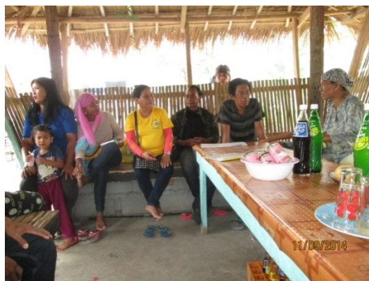
Gathering of Primary Data in Datu Paglas