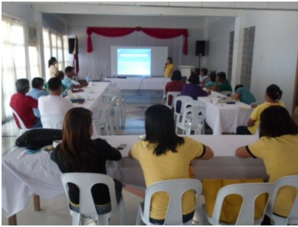
CARPO Arlene Linsag welcomes the participant during the Wrap Activity of PPM Batch 1