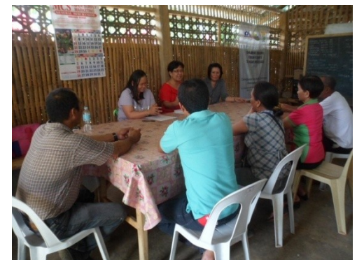
FGD validation of OENADA in Cabanglasan Bukidnon