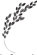
Rice Farm - Area Planted (in ha)