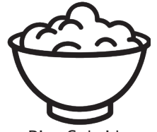
Rice Subsidy (in sacks)